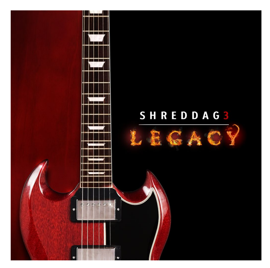
Shreddage 3 Legacy Product Manual

An Impact Soundworks Instrument for Kontakt Player 5.7+