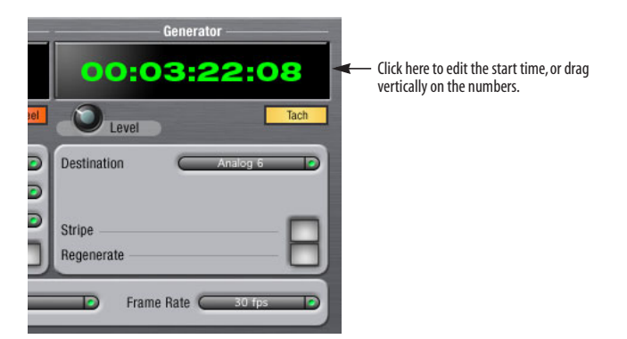
Figure 2: Setting the time code start time.

Click this button to start or stop time code. To set the start time, click directly on the SMPTE time code display in the Generator section and type in the desired start time. Or drag vertically on the numbers.