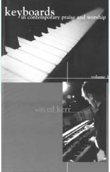
an instructional video

contacted directly via email at ed@kerrtunes.com.