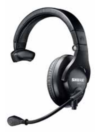
BRH441M Single-Sided Broadcast