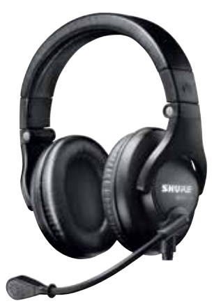
BRH440M Dual Sided Broadcast Headset