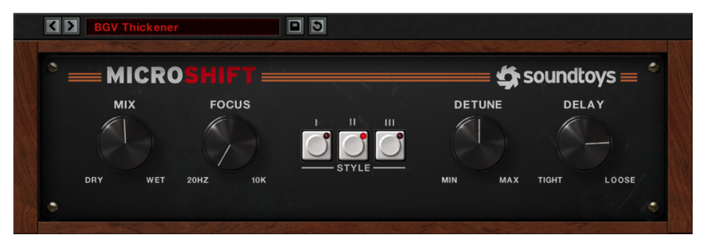
Figure 2: MicroShift's Main GUI