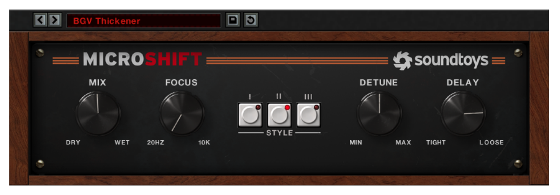
Figure 1: The MicroShift Control Panel