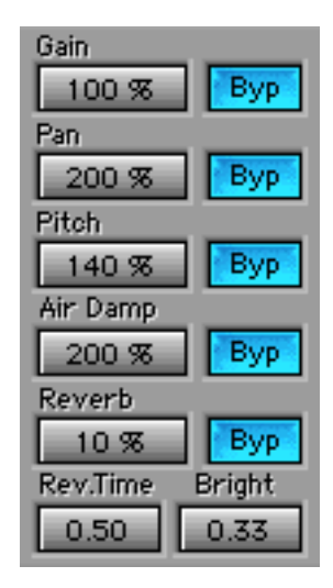
Master Reality control section