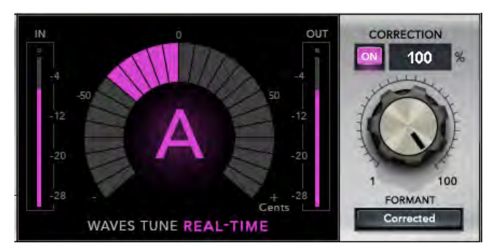
Example 1: Correction knob is set to 100%. The meter shows 40 cents pitch down.

The Pitch Correction Section controls the amount of corrected signal that will be applied to the original sound. The target note and the amount of correction applied are indicated by the Correction meter. In the two examples below, vocal pitch is 40 cents above A.