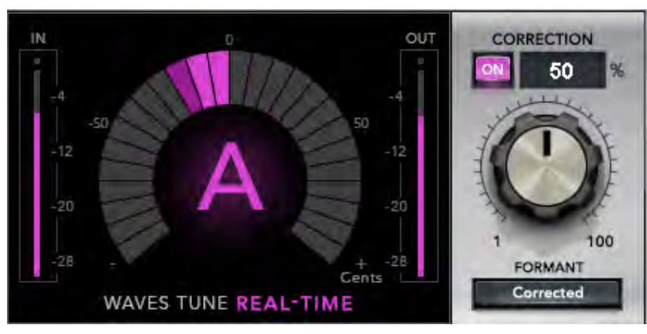
Example 2: Correction knob is set to 50%. The meter shows 20 cents pitch down.